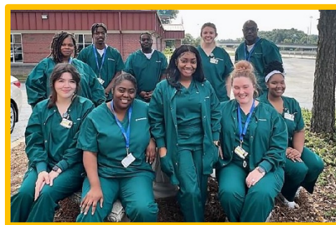
Southeastern Columbia's first cohort of Radiology Technology students. We are excited to have you!