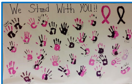
The campus celebrated Breast Cancer and Domestic Violence Awareness during the month of October.