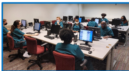
Our first cohort of Radiologic Technology students get logged in to Southeastern accounts one their first day to ensure continued success.