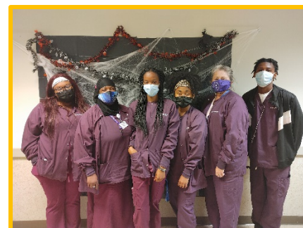
Medical Assistant students are having a Spooktacular time at Southeastern!